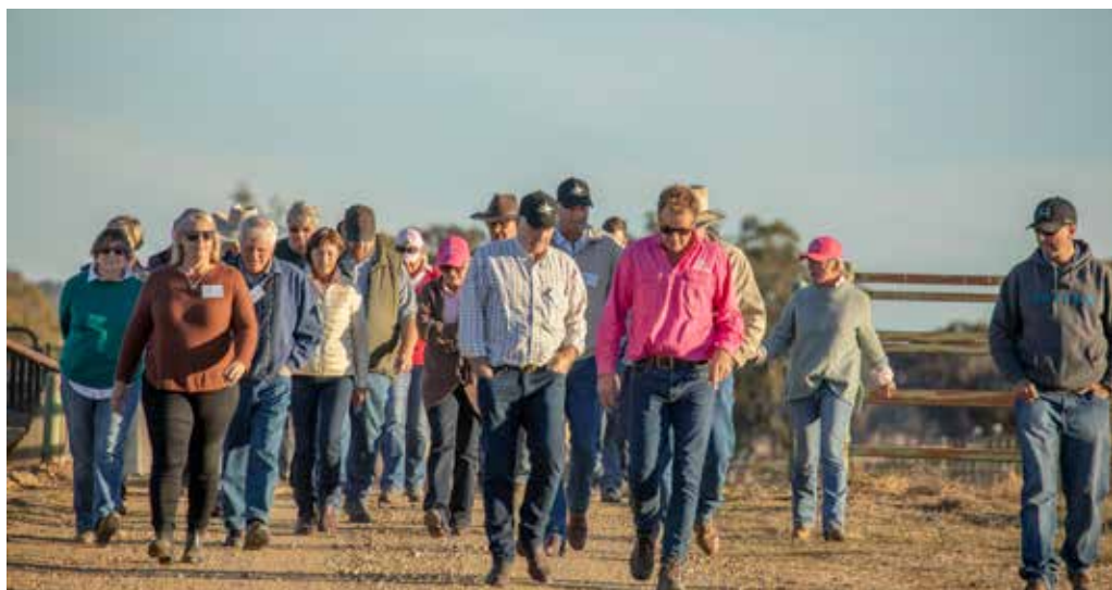
TEAM TE MANIA MEMBERS VISITING TULIIMBA RESEARCH FACILITY, ARMIDALE, NSW

The Team alliance also endorses its members with the marketing power of the Te Mania Angus brand, which has gained strong, and sustained, support from feedlotters such as Rangers Valley, at Glen Innes in NSW. Rangers Valley source Te Mania Angus genetics as a cornerstone of its premium brands, whilst also providing Team Te Mania members with valuable performance feedback.